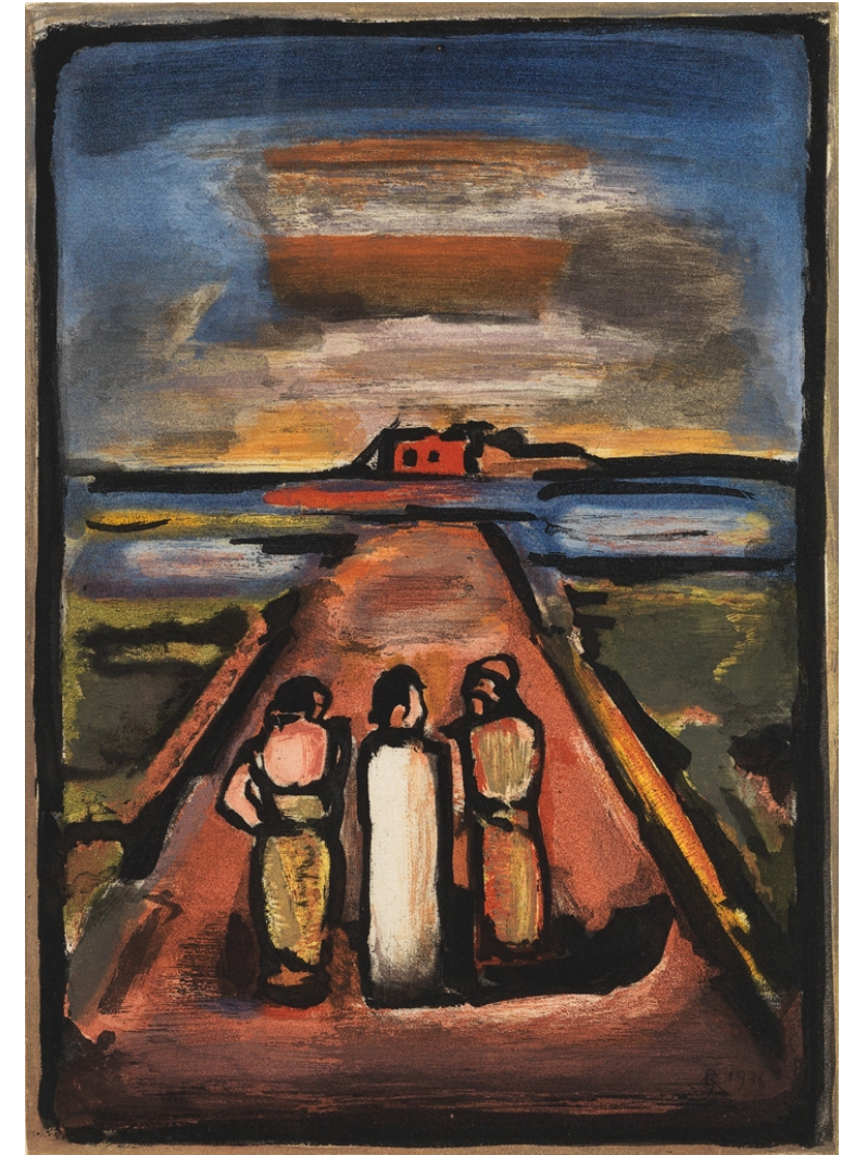
"Les disciples" (1938) Georges Rouault

We will have pancake supper tickets available to buy in advance for $10. Offer to your neighbors, family, friends.